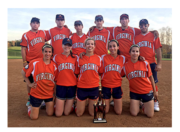
The Co-Rec Gold team finished second in its division.

The invitational has been donating proceeds from the invitational for 15 years to ReadyKids, formerly called Children, Youth and Family Services, one of the oldest nonprofits in Charlottesville. The nonprofit, which